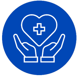
Access to Healthcare (including Health Literacy & Education)

The purpose of this implementation strategy report is to align the hospital's limited resources, program services, and activities with the findings of the CHNA. This includes identifying strategies and activities that Methodist Richardson Medical Center and Methodist Hospital for Surgery will employ to address the health priorities identified in the most recent CHNA: