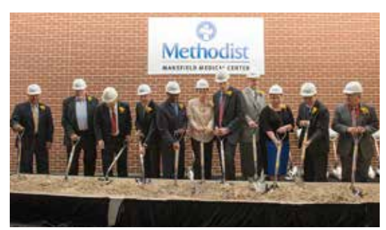
Methodist Mansfield Community Advisory Board