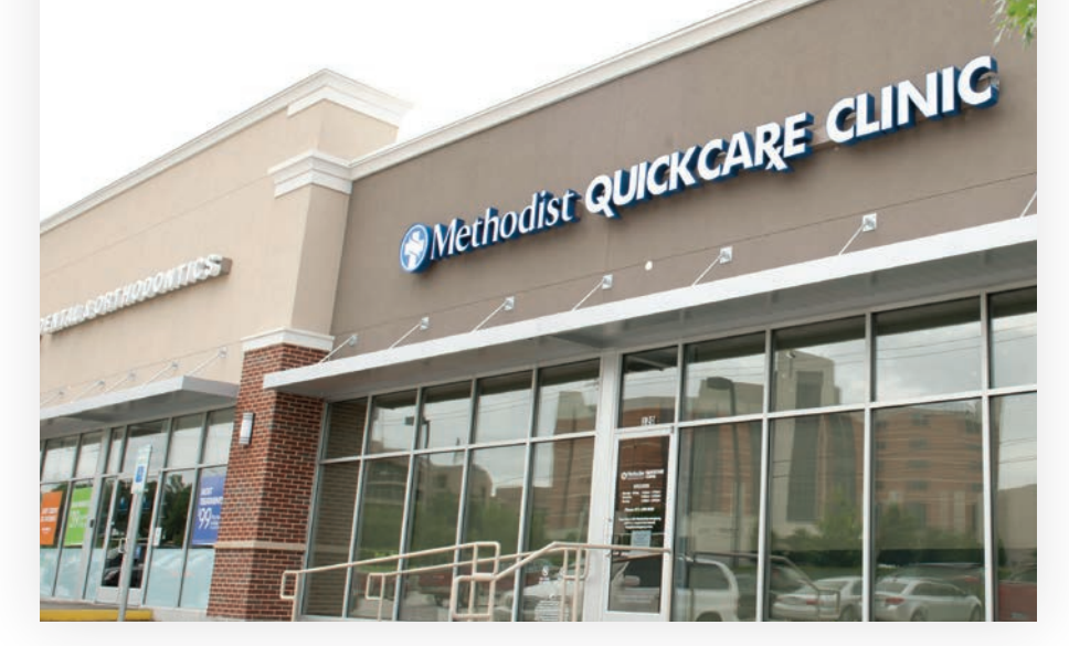
Methodist QuickCare Clinic moved to a new location this year, 3335 W. Wheatland Road in Dallas, making after-hours and weekend care more convenient than ever.