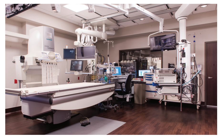
The new GI lab features two advanced fluoroscopy procedure rooms with new equipment in a high-tech setting.

Gastrointestinal (GI) diseases have a substantial impact on patients and the healthcare system. Each year, $135.9 billion is spent on