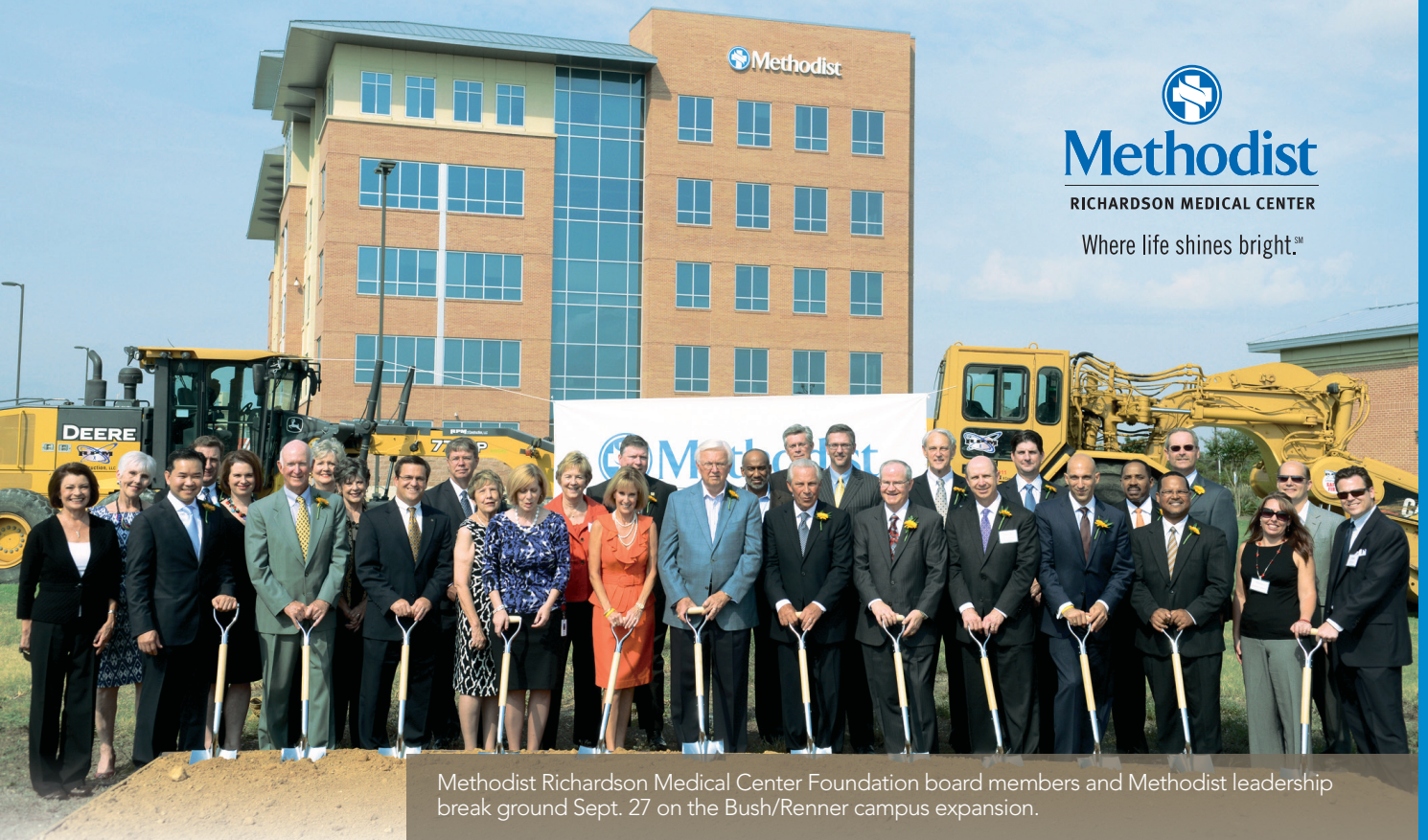
Methodist Richardson Medical Center Foundation board members and Methodist leadership break ground Sept. 27 on the Bush/Renner campus expansion.