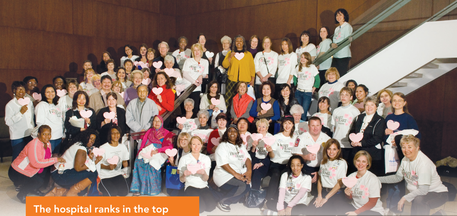
Heart to Heart participants make pledges to improve their heart health.

The hospital ranks in the top 10 percent in the nation for consistently surpassing the national standards for STEMI heart attack treatment times.