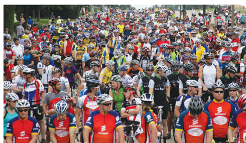
Racers gather for the WildRide! Against Cancer, which helped raise more than $175,000 for Methodist Richardson Cancer Center.