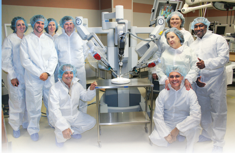
Methodist Richardson hosted the 2012 Leadership Richardson class, here with the da Vinci® Surgical System.